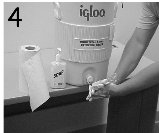
Wash for 20 seconds