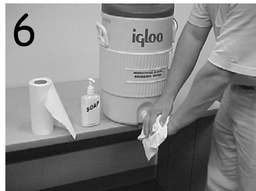
Dry with paper towels